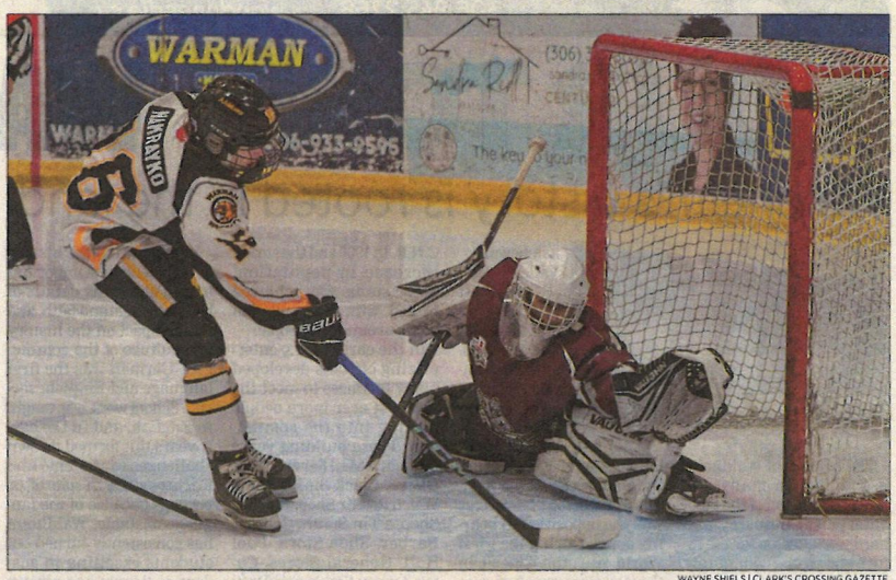
RIGHT IN THE KITCHEN

the right stuff." Our region is well-represented on the team with players from Warman (10), Shellbrook (3), Rosthern (1), Clavet (1), Wakaw (1) and Allan (1).